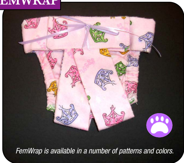
FemWrap is available in a number of patterns and colors.